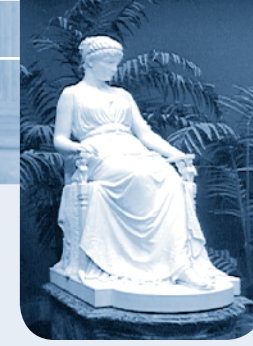
Statue of Penelope situated at the De Young Museum in San Francisco

The Daughters of Penelope are making a difference in a number of community efforts throughout the world.