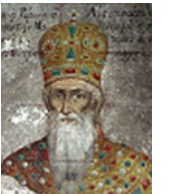
1300 AD Andronicus II Palaeologus