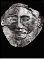
1500 BC Mycenaean Mask