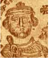
620 AD Heraclius