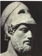
450 BC Pericles