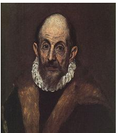
1610 AD El Greco