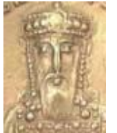
950 AD Constantine VII Porphyrogenetus