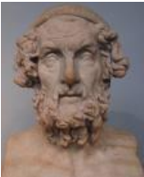
750 BC Homer