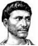
250 AD Diophantus