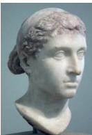
45 BC Cleopatra