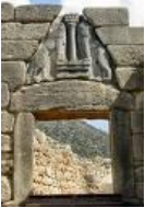
1150 BC Ruins of Dorian Invasion