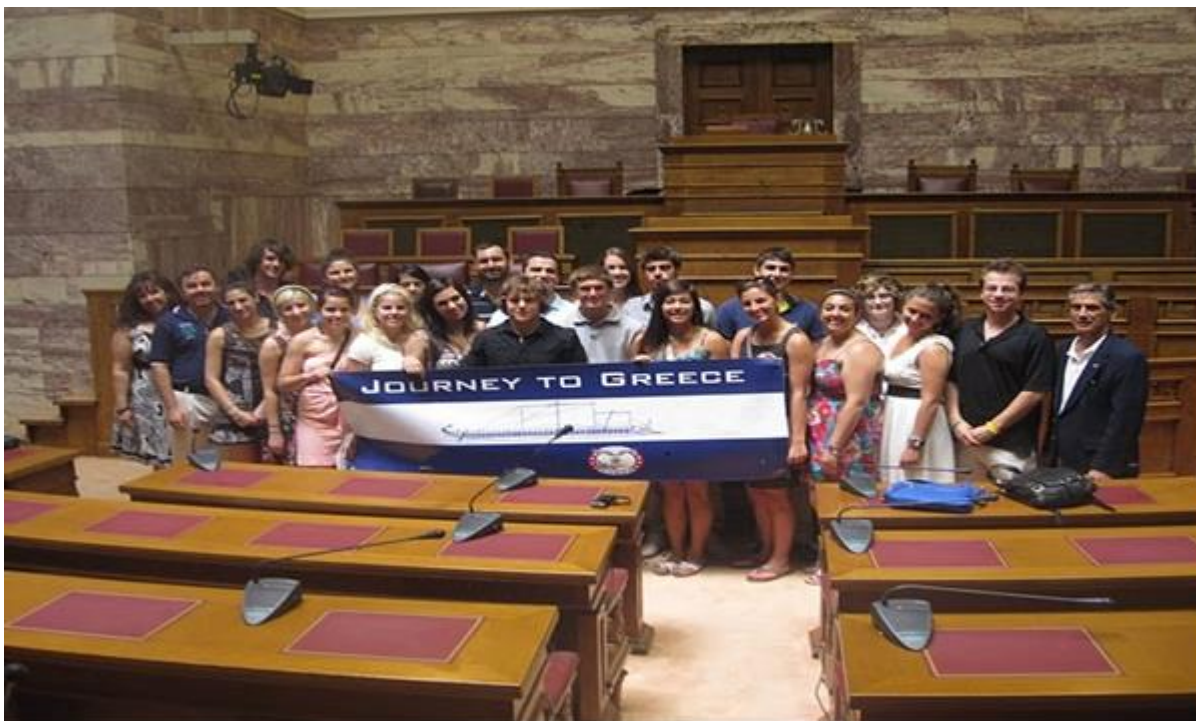
AHEPA JTG students at the Hellenic Parliament

Drive along the Attica coastal road and after passing Glyfada, Vouliagmeni and Varkiza we will visit to the most southern point of Attica Cape Sounion and the Temple of Poseidon. On the way, you will enjoy the splendid view of the Saronic Gulf and the little islands offshore.