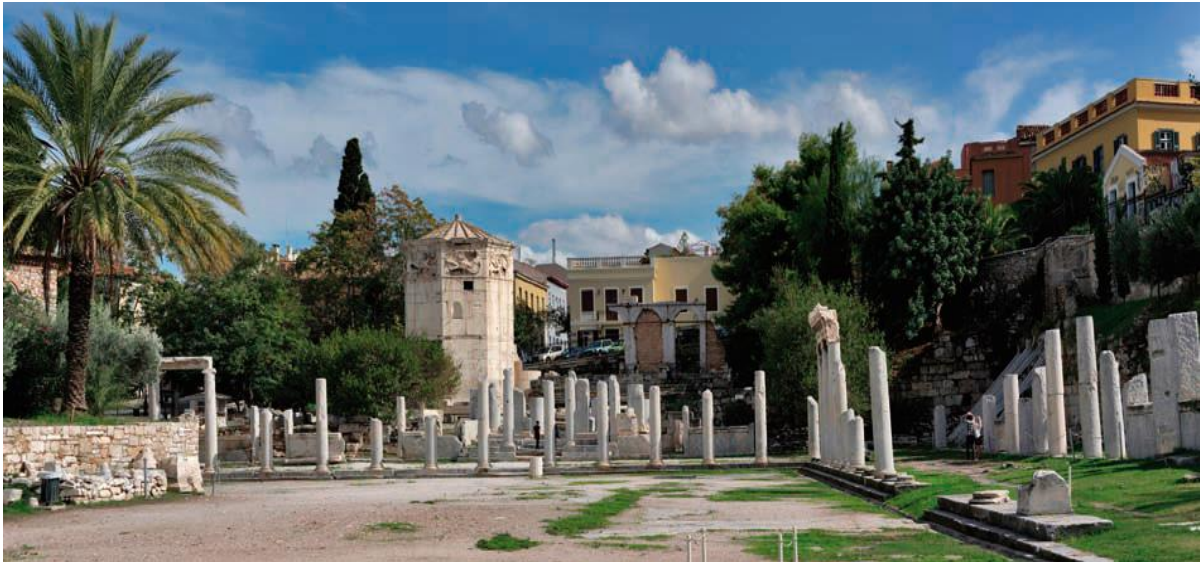
The Webster University Cultural Center in Plaka

Further, prestigious accreditation bodies in their respective fields accredit the various schools/ departments of the University.