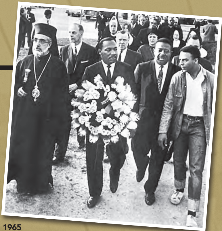
1965 His Eminence Archbishop Iakovos marching with Martin Luther King, Jr. in Selma, Alabama.