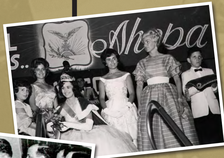
1956 Miss AHEPA