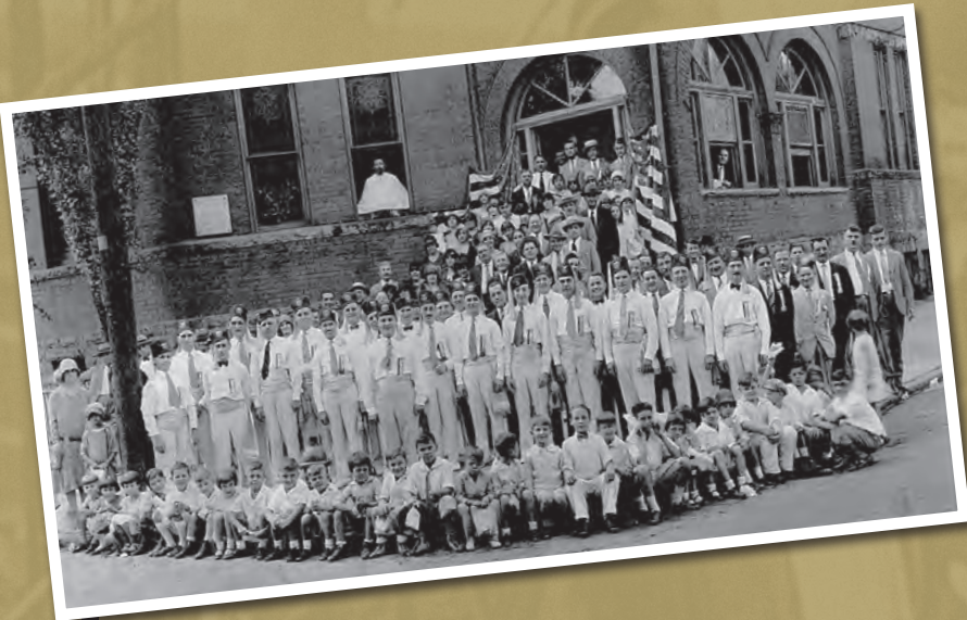
1922 The Mother Lodge AHEPA Chapter #1, Atlanta, GA