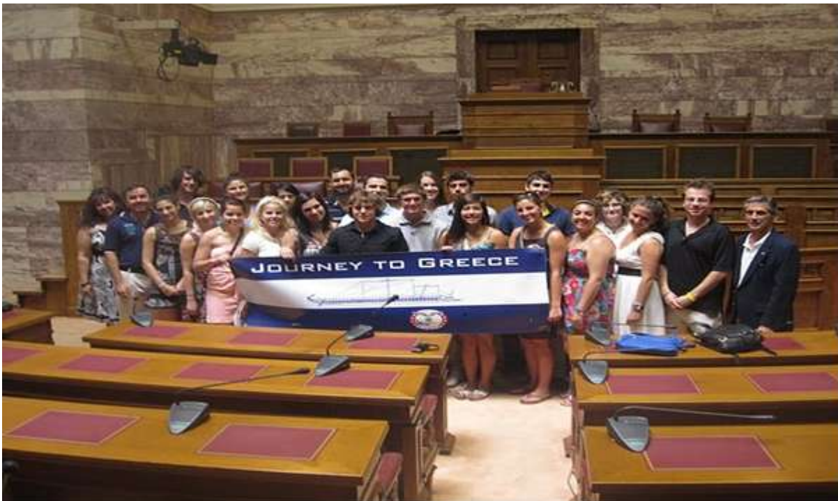
AHEPA JTG students at the Hellenic Parliament

Drive along the Attica coastal road and after passing Glyfada, Vouliagmeni and Varkiza we will visit to the most southern point of Attica Cape Sounion and the Temple of Poseidon. On the way, you will enjoy the splendid view of the Saronic Gulf and the little islands offshore.