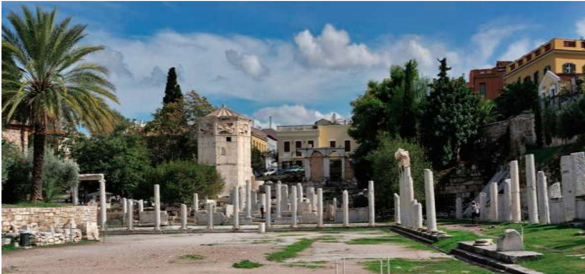
The Webster University Cultural Center in Plaka

Further, prestigious accreditation bodies in their respective fields accredit the various schools/ departments of the University.